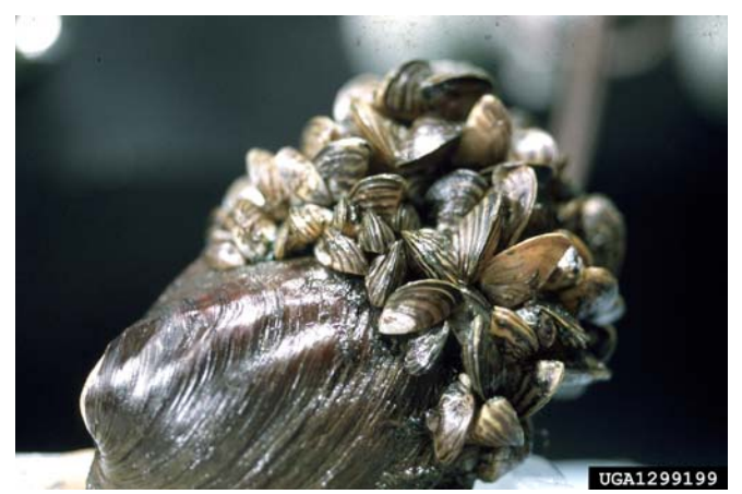
Zebra mussels ( Dreissena polymorpha ) attached to a native clam ( Amblema plicata ).

Many KHLCF-funded projects are associated with significant aquatic resources including sites along the Terrapin Creek in western Kentucky (Kentucky State Nature Preserves Commission) and the upper Green River in south-central Kentucky (Western Kentucky University and Kentucky Division of Water Wild Rivers Program), two of our state's most biologically diverse stream ecosystems. These and a number of other aquatic-related projects meet multiple KHLCF criteria including providing habitat for rare, threatened or endangered aquatic fauna or sites whose natural functions may be subject to loss or alteration.