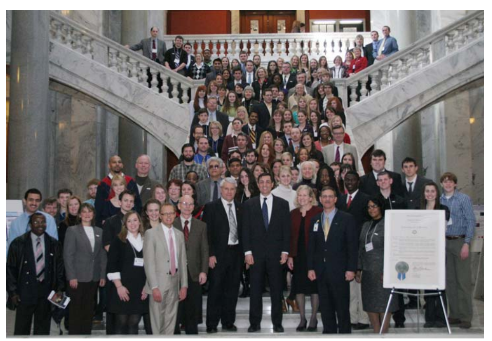
Students and mentors gathered in Frankfort for the Posters-at-the-Capitol 2011 event.

cells. Using the worldwide Protein Data Bank, 5965 proteins that bind zinc were identified and the coordination geometry of each zinc site was classified as tetrahedral, trigonal bipyramidal, or octahedral.