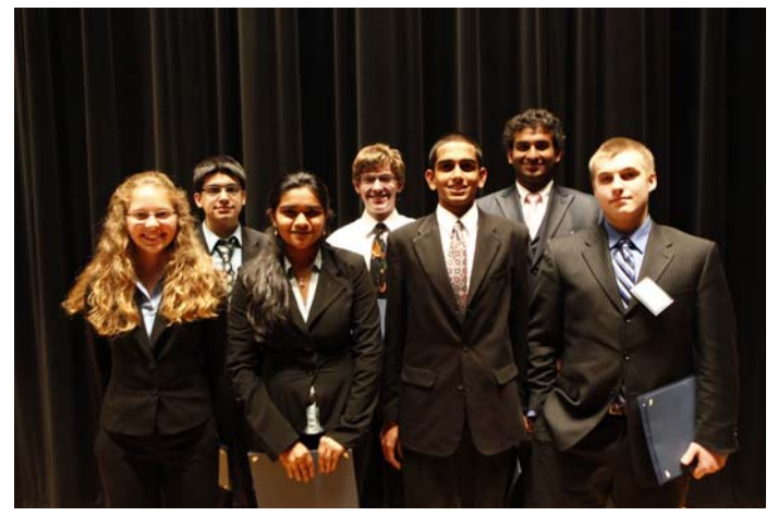
KY-SEF 2011 High School Best of Fair winners