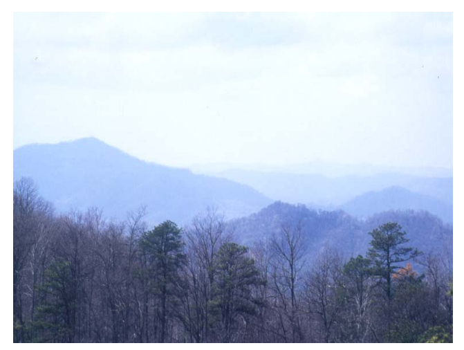
Stone Mountain View

All KAS members can support the KHLCF by buying a nature license plate at their next renewal; ten dollars goes to the Fund for each plate sold.