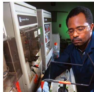
A flow-through colorimetric autoanalyzer is used to determine nutrients in shallow ground water.