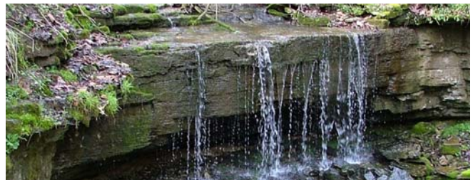
Waterfall on Lower Howard's Creek in Clark Co.

All KAS members can support the KHLCF by buying a nature license plate at their next renewal; ten dollars goes to the Fund for each plate sold.