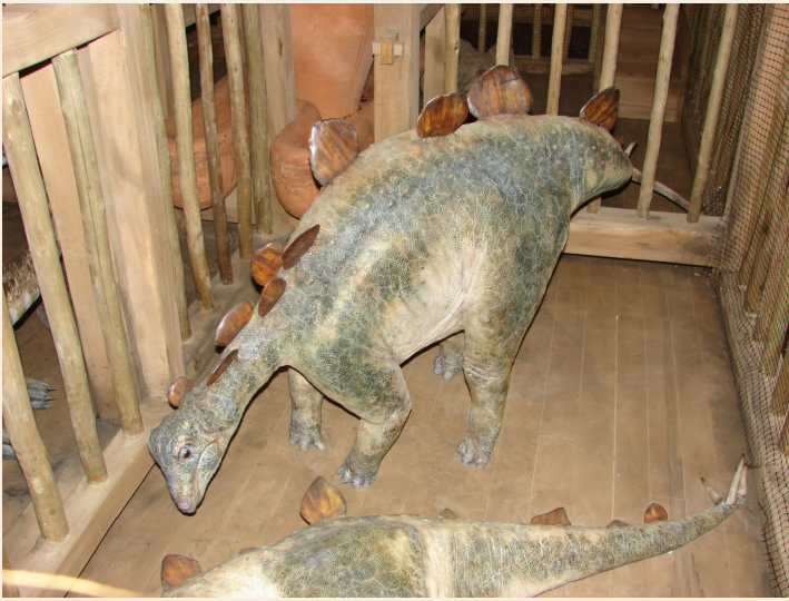
A pair of Stegosaurus in a pen on the Ark.