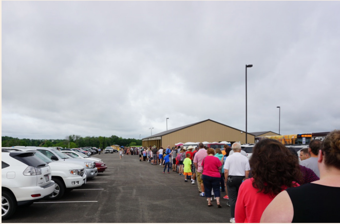
Opening day line.