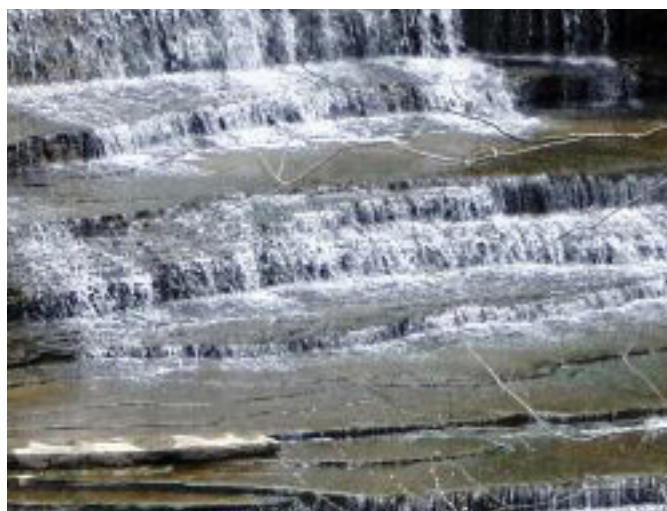
"Clifty Falls at Clifty Falls State Park"

There will also be a field trip on Saturday, November 5th to the Madison, Indiana, area. This trip to Clifty Falls will include some local history, as well as stratigraphy and fossil hunting. Open to all KAS members! Further details will be available soon at our website: http://kyacademyofscience.net/programs/annual-meeting/