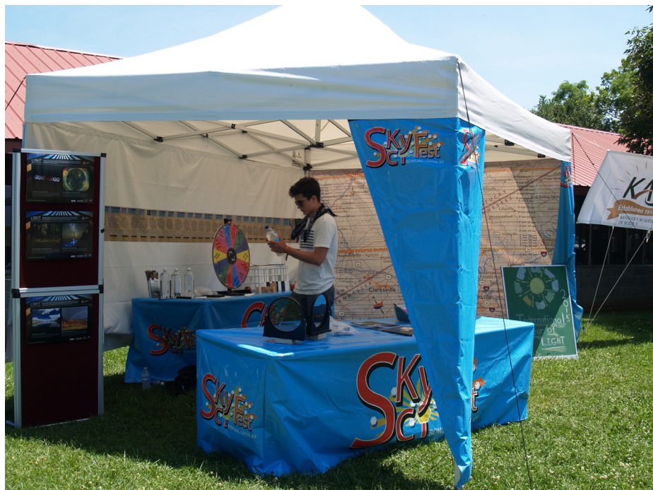
ROMP Music Festival