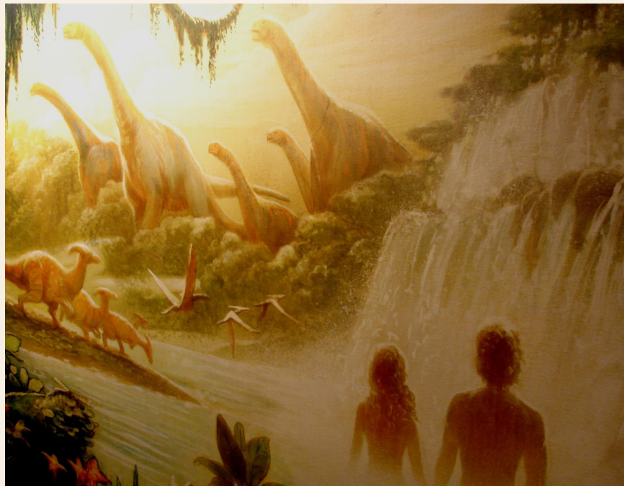
Depiction of Adam and Eve with dinosaurs.