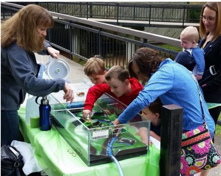
Lake Barkley Discovery Festival