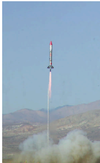
Lift-off of the Prospector 12A sub-orbital test flight