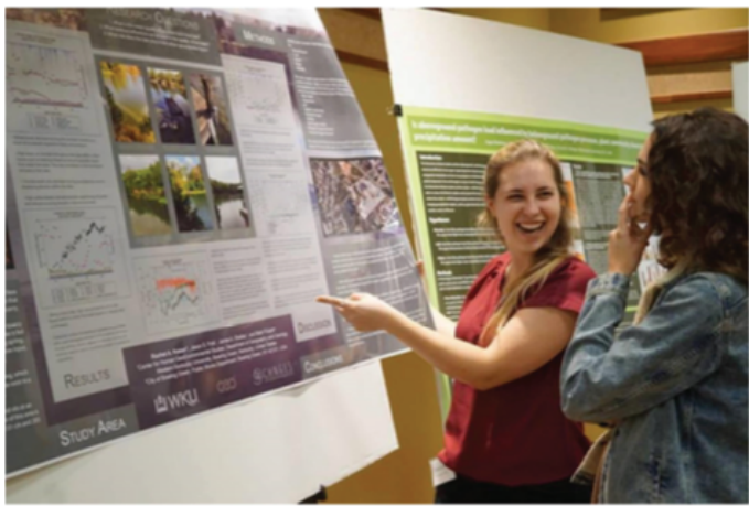
Social media photo contest winner