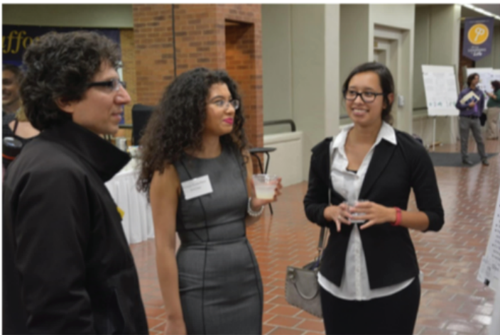
188 presenters gave poster presentations about their research

See dozens more photos from the 2017 KAS Annual Meeting in Murray : https://www.kyscience.org/kas_annual_meeting.php