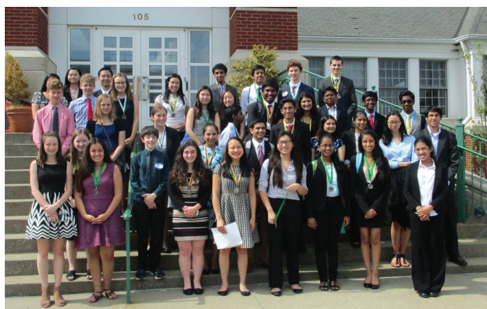
Pictured above is the KJAS 2017 participants

More details at https://www.kyscience.org/kentucky_junior_academy_of_sci.php