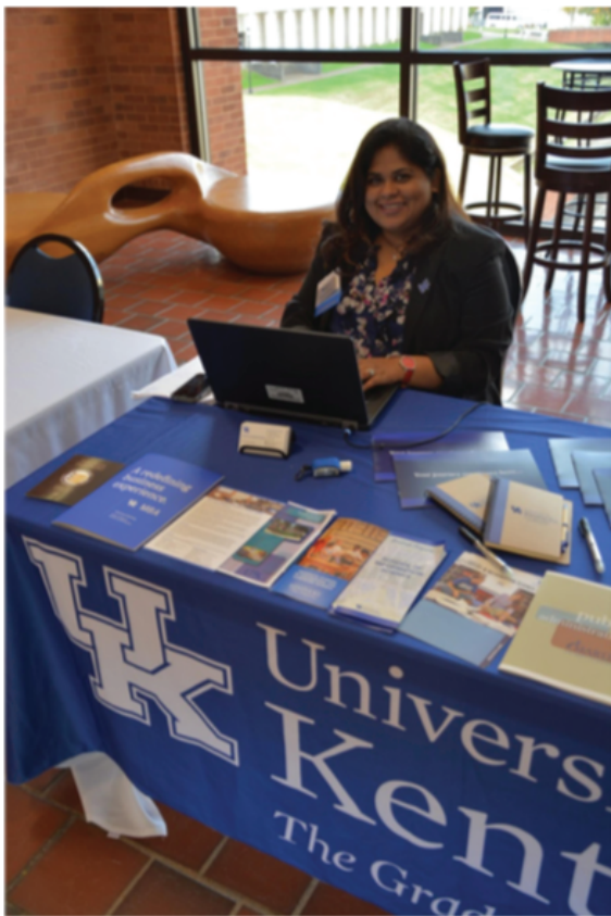
Exhibitors joined us from all over the Commonwealth