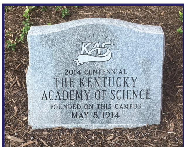
Placement of Monument at UK